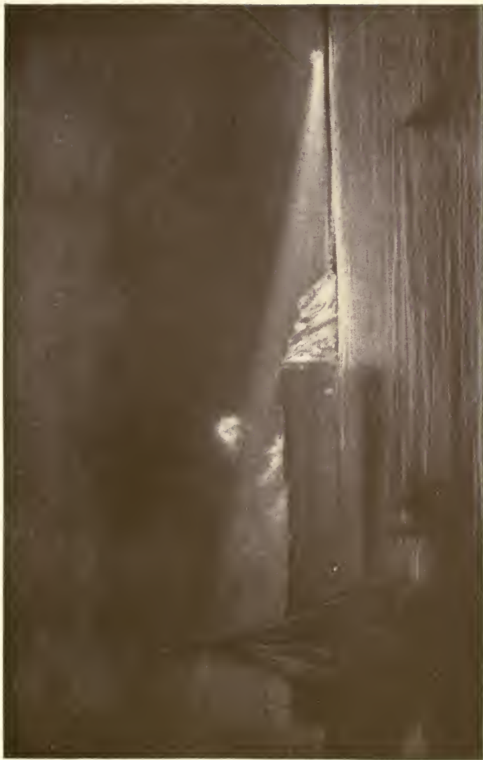
FORT SUMTER UNDER BOMBARDMENT.